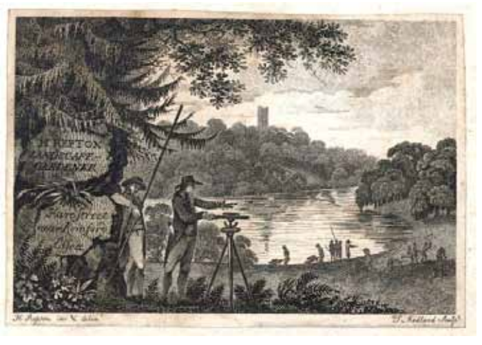
Humphrey Repton Business Card

Viewpoint created by Caroline Millar