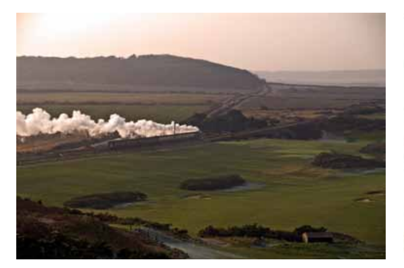
Skelding Hill steam train

Together man and ice have created a splendid view that might just win the award for the best view in Norfolk.